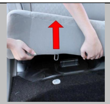
Step#5-Remove Bottom Cushion

(Pull up on the bottom cushion to snap off the hooks. This will give you the chance to install the cover.