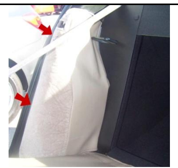
Step#1 – Apply side cover (Apply side cover. Push in plastic wedges between door and cushion.)