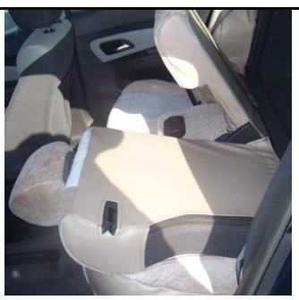
Step#2 – Install Backrest (Apply backrest, slide down.)