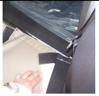
Step#3- Attach Velcro (Attach Velcro on the back of seat cover.)