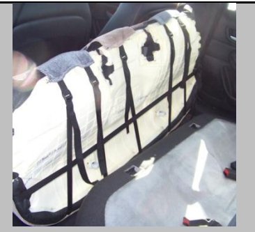
Step#6- Install Bottom Cushion (Apply the Bottom Cushion, wrap the cover over the cushion.)

(Pull up on the bottom cushion to snap off the hooks. This will give you the chance to install the cover.