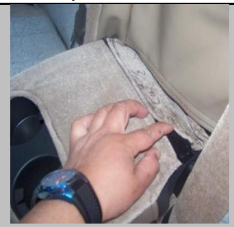
Step#4– Install armrest (Slide on armrest covers and apply velcro.)