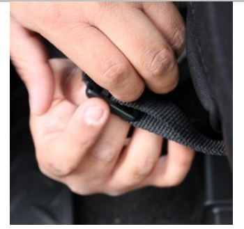
Step#7- Attach Laces Together (Attach laces to the buckles and tighten down.)